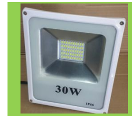
30W - 3600 Lumens SKU: SMD30