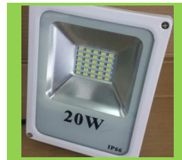
20W - 2400 Lumens SKU: SMD20