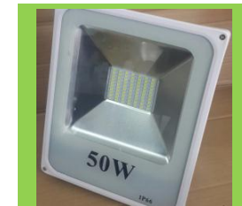
50W - 6000 Lumens SKU: SMD50

IP 66 Life span: up to 50 000 Hrs 120 Degree beam Cool white White casing and toughened glass