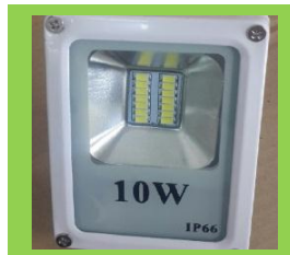
10W - 1200 Lumens SKU: SMD10